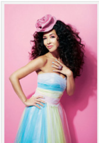
Myleene Klass in Hello Magazine